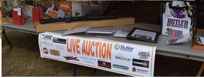
Photos from the Burgers and Brews annual fundraiser.