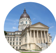
Meet your Legislators Legislative Panel